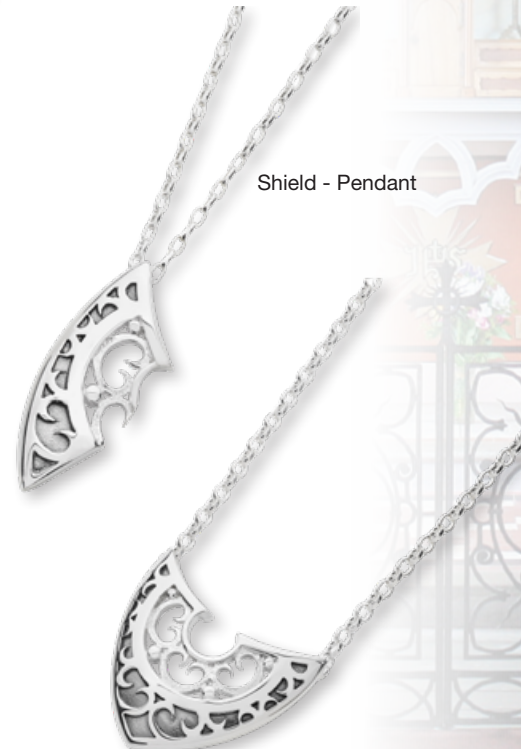
Shield - Pendant