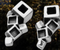
Blocks - Stud Earrings