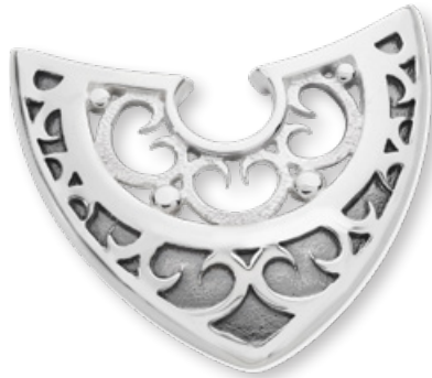
Shield - Brooch