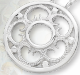
Lamb Holm - Pendant

Inspired by the Italian Chapel, built as a place of worship by Italian POW's during WW2, while they built the Churchill Barriers. The chapel was built using scrap material and still stands as a memorial to man's faith, ingenuity and hope for peace in times of war.