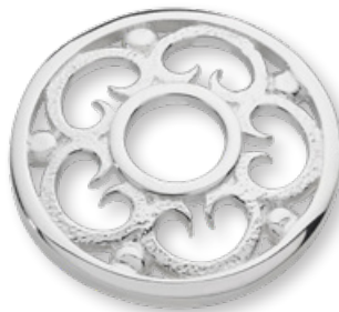
Lamb Holm - Brooch