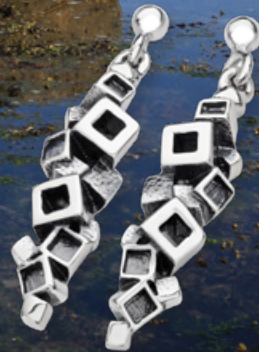
Blocks - Drop Earrings