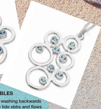
BUBBLES Inspired by the sea washing backwards and forwards as the tide ebbs and flows on Orkney beaches, leaving clusters of bubbles on the sand.