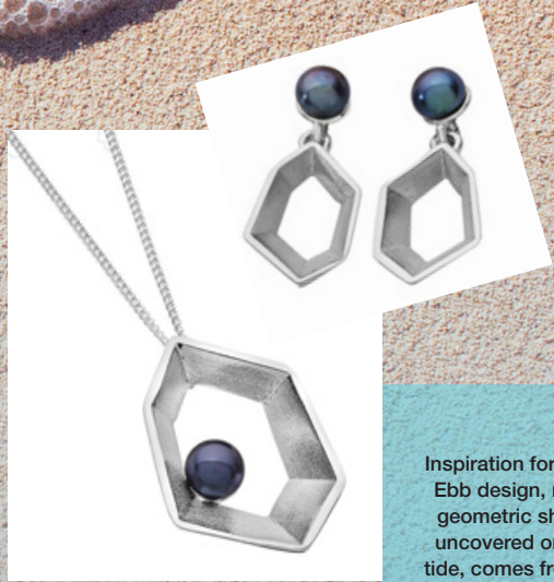
EBB Inspiration for our contemporary Ebb design, reminiscent of the geometric shape of barnacles uncovered on the rocks at low tide, comes from fond childhood memories of long summer days spent exploring the beach.