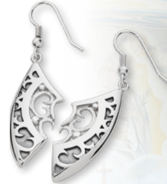
Shield - Drop Earrings